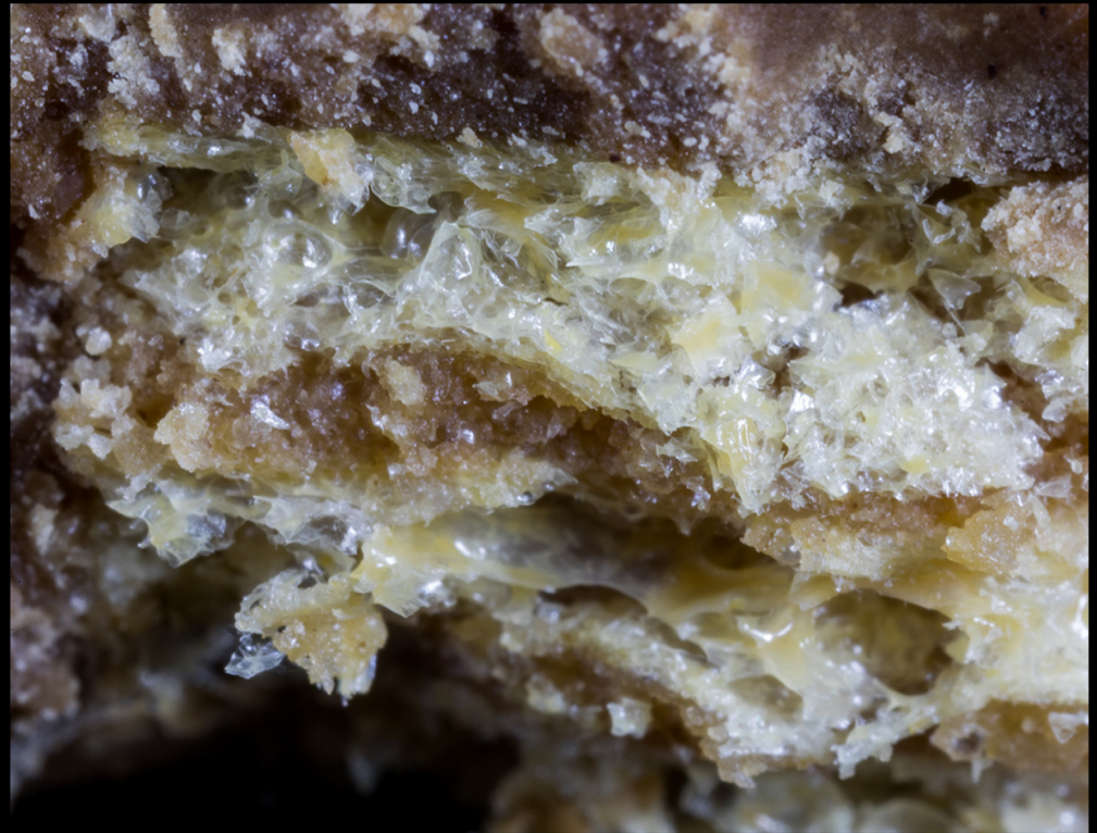
Cross section of a Kit Kat Bar

The world largest Hershey's Kit Kat Bar isn't actually a 2lbs Kit Kat Bar, it is a 2 lbs box filled with individually wrapped snack size Kit Kats packaged to look like a