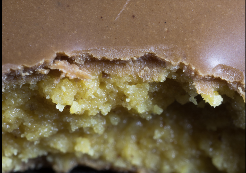
Cross section of a Reese's Cup

Reese's Peanut Butter Cups or Resse's Cups as they are commonly called were actually not invented by Milton Hershey. Reese's Cups were invented by H. B. Reese, who was a local dairy farmer and supplier for Hershey's Chocolate Company.