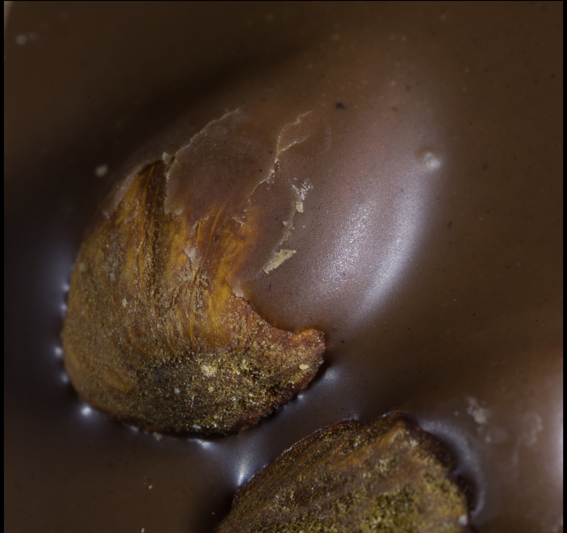
Whole Almond in Hershey's Milk Chocolate with Almonds Bar

Other products that feature nuts often have a slightly different chocolate nut coating process. Similar chocolates featuring nuts, like Hershey's Almond Joy (a coconut chocolate bar) usually coat the nut in chocolate before the nut is placed in the bar. Hershey's Milk Chocolate with Almonds Bar is extraordinary in the fact the nuts go directly into the bar without a secondary chocolate